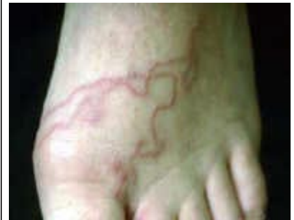
Hookworm infection from walking near contaminated soil.

One pill once a month will prevent heartworm, hookworm, whipworm and roundworm.