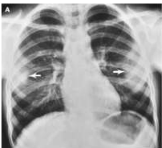
Pneumonia from contact with a pet infected with strongyloides.

This photo is also from Mercer Island's off-leash dog park.